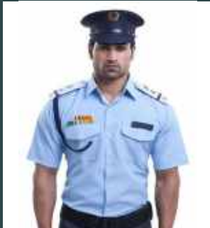
24 x7 Security