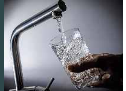
Good Water Source