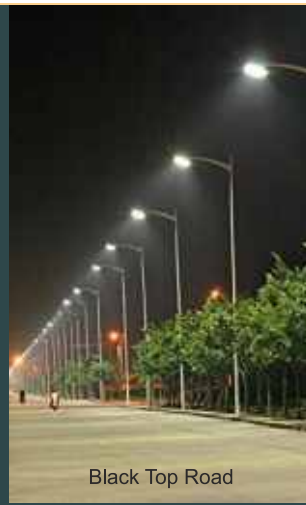
Black Top Road